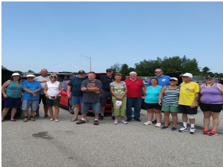
The Northeast Ohio Mustang Club brought 8 cars to the show. Some went home winners!!