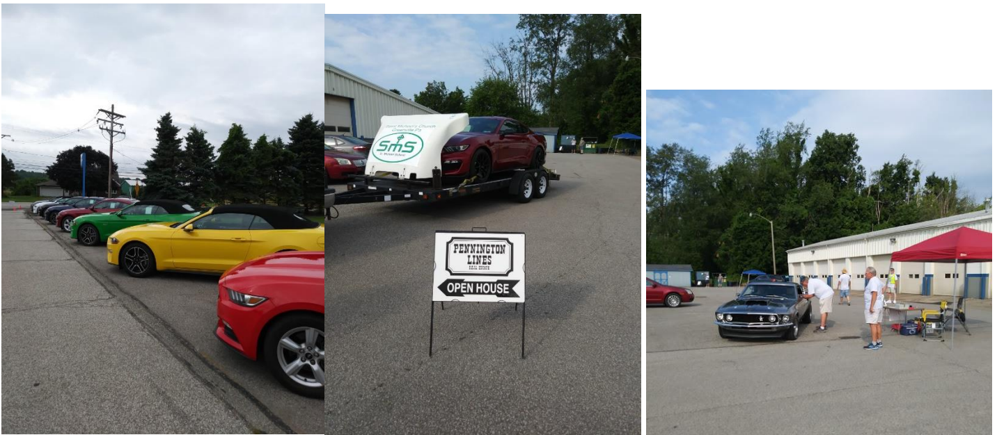
Ferrando's had a selection of Mustangs for sale-wait isn't this a car show??? – Checking in cars