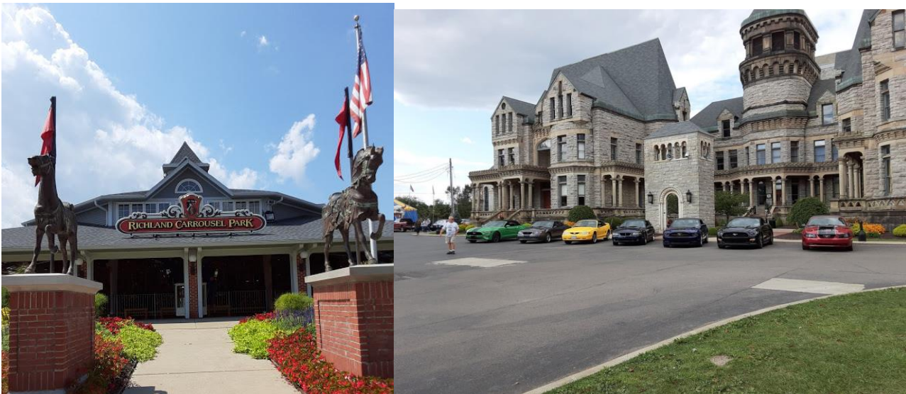
First stop Richland Carousel Park and the Ohio State Reformatory

The 2019 Snooze and Cruise is history. More on the trip and the fun things we did will be in the Oct. Pony Post.