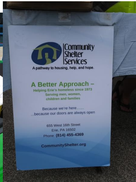
Stuffing the Mustang with supplies to support our charity – Community Shelter Services.